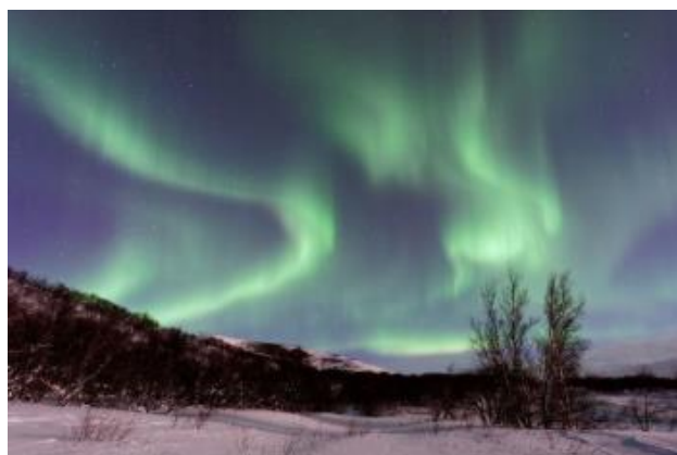
2 - Polar Night

We have had a fantastic start to the new term after the Christmas break in Rowan. In writing this term, the children have been exploring stories from other cultures, enjoying learning about different traditions, settings, and characters from around the world. The children were intrigued by the Polar Night of countries in north Scandinavia, such as Sweden. In history, we have begun our new exciting topic on the Ancient Egyptians, where the children are already fascinated by the inventions, Gods and Pharaohs. Our science lessons this term have focused on teeth, helping the children to understand their purpose and the way different animals use them. We have also enjoyed getting active with some orienteering, developing teamwork, problem-solving, and map-reading skills while having lots of fun!