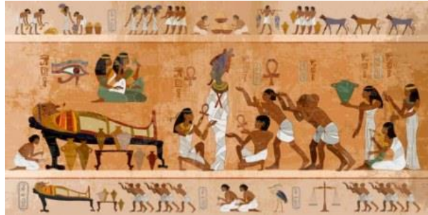
3 - Ancient Egyptians