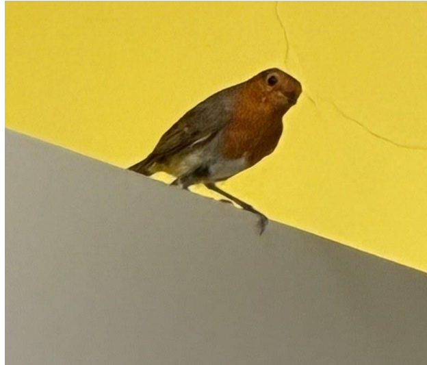
1 - We also had another visitor in Acorns!