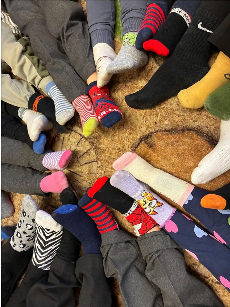
2 - Odd Socks Day marked the start of National Anti Bullying week.